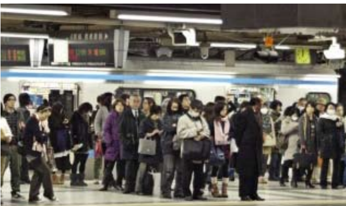
When Waiting for Trains at the Tokyo Train Stations... (image from http://www.deepjapan.org )

Indeed we, the foreigners, cannot go away without the impression that the Japanese people are generally a hardworking, disciplined, happy and dedicated lot.